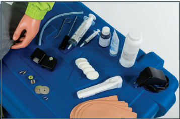
Accessories incl. in packaging