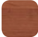
Amber Cherry 7919-38