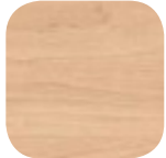
Hard Rock Maple 10776-60