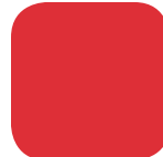
Fire Red S-498-CA