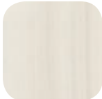
White Cypress 7976-38