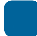
Royal Blue SB009N