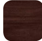
Chocolate Pear WA 7942-38