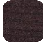
Classic Chocolate OU313